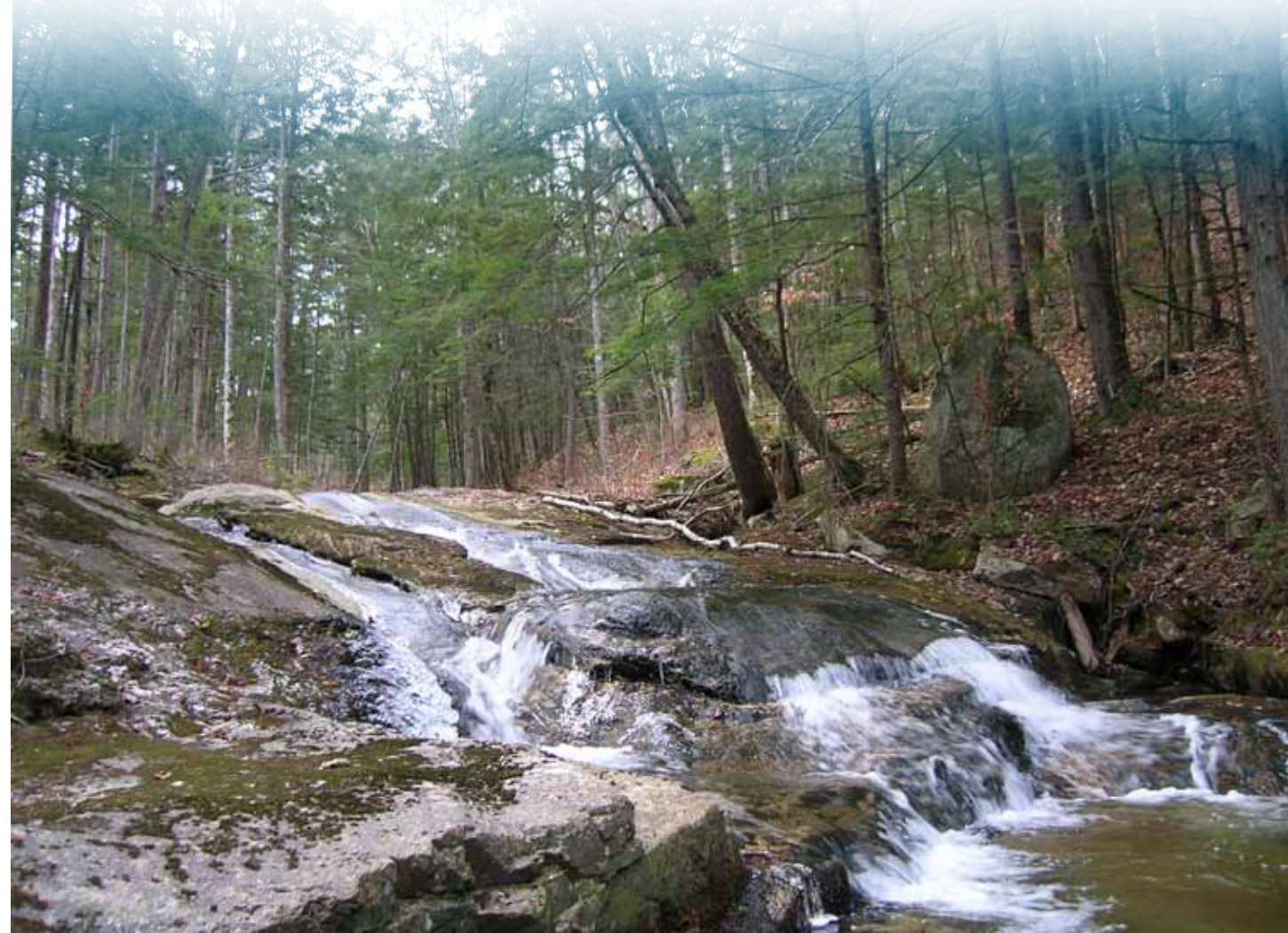
6 A western branch of the Weeks Brook as it flows through the Leita Monroe Lucas Preserve

As the Land Trust forges ahead with new and exciting projects, we are forever mindful both of our duty and responsibility for the land we own and of our commitment to maximize the community benefit that these special places afford.